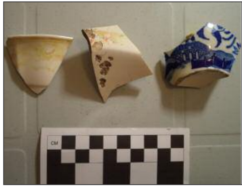
Typical ceramic assemblages encountered by the author (from site BbHj-45, in Tiverton, ON)