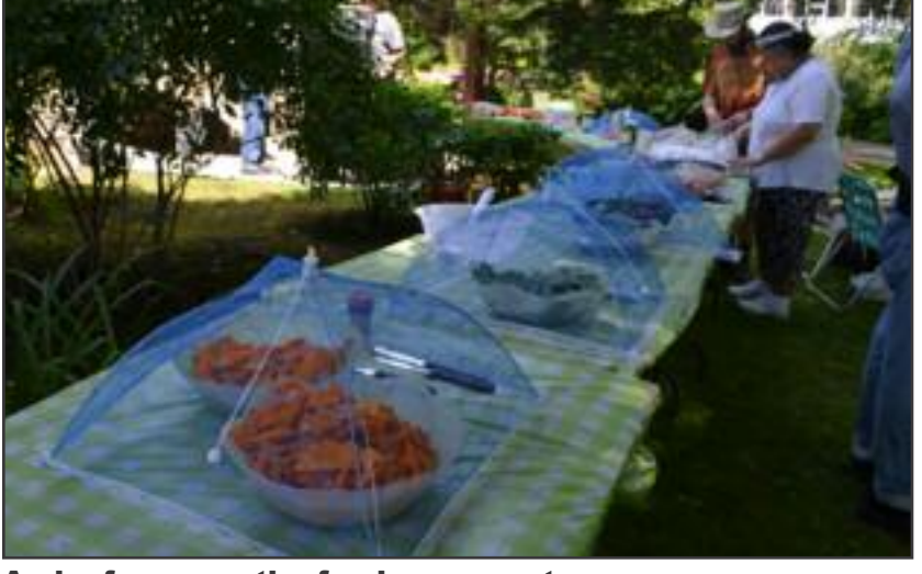
And, of course, the food was great.